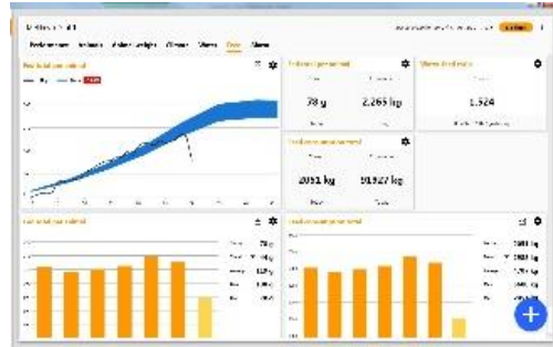
NOVUS Farm Management Software