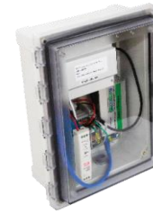
VLink Remote Access Node