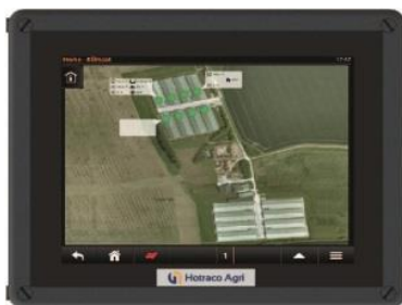
FORTLINK-S management display