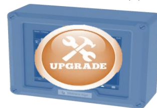
FORTICA Software Upgrade for ENERGY mode with (3) Heat Exchangers