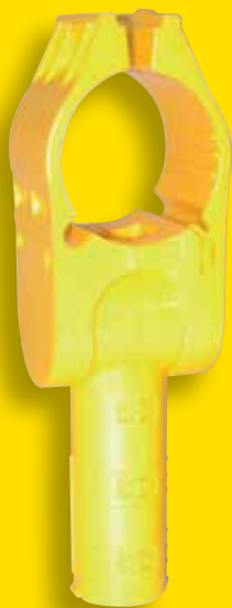
The Best Start II Chick Feeder